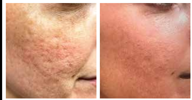
HALO® | 3 MONTHS POST 2 TREATMENTS