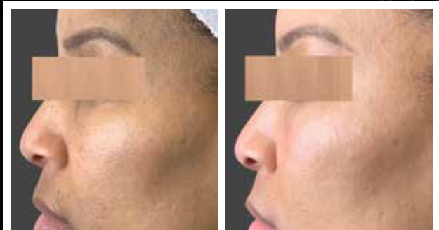
HALO® | 2 WEEKS POST 1 TREATMENT