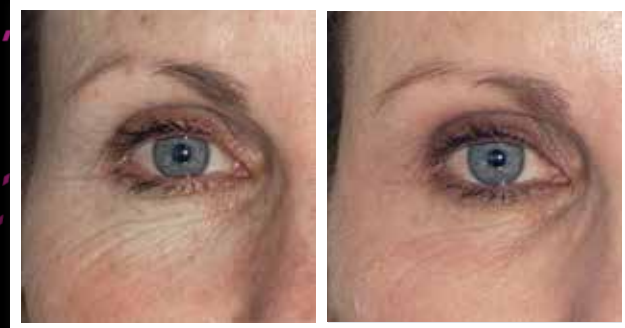
HALO® | 1 MONTH POST 1 TREATMENT